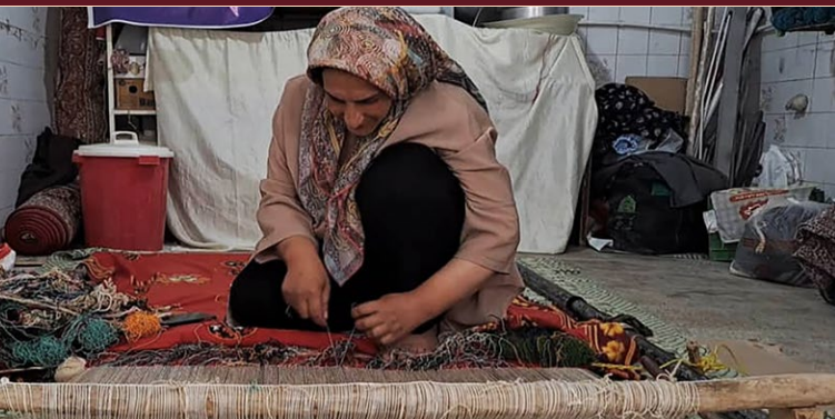
from the Tandem "Curating and Weaving Memories"